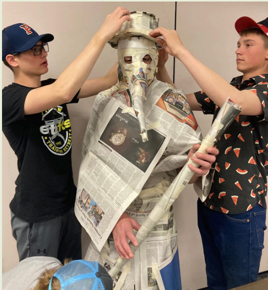
The Cokeville team took third in the newspaper fashion show with their plague doctor outfit.