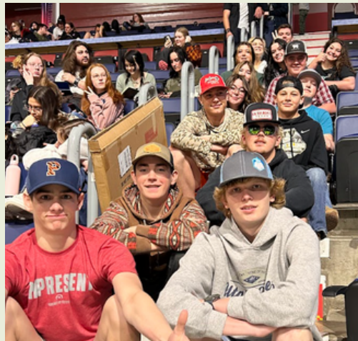
Cokeville submitted 78 pieces, and 19 students attended.

Art students traveled to Casper for the Wyoming High School Art Symposium, where they submitted artwork for awards and picked up techniques from other students and their art.