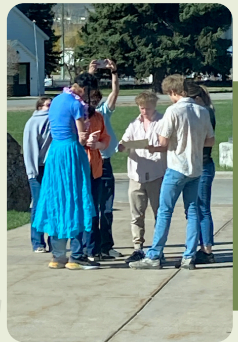
Left: The seniors watch each other's films.