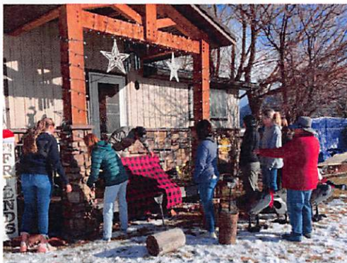
Left and bottom left: The senior capstone class helps a recently widowed member of the community hang Christmas lights.