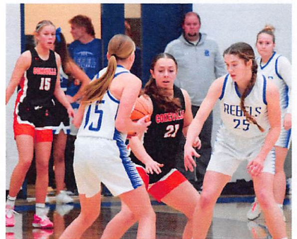
The girls battle for ball control against the Rich Rebels.