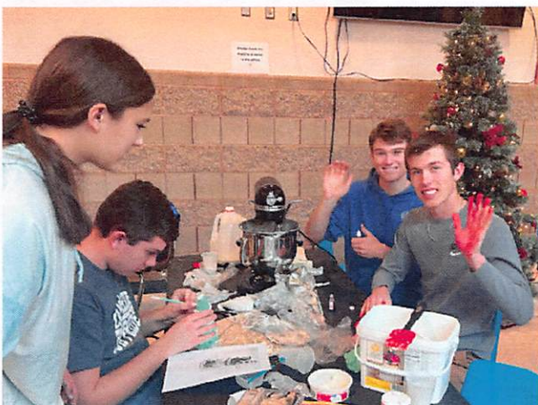
Left: Students have fun with fondant and food color while racing against the clock.