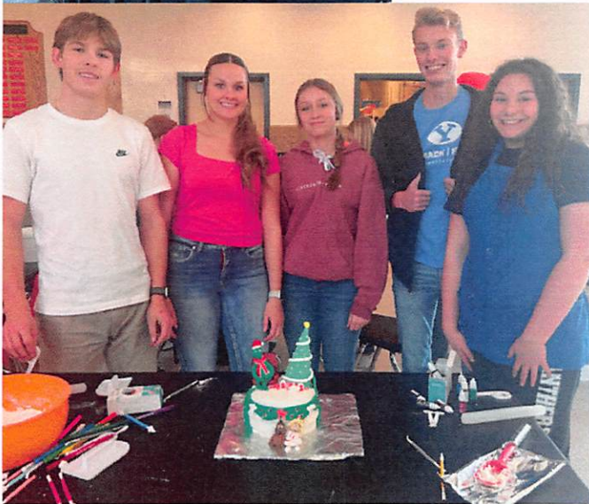
Needless to say, students had lots of fun being creative and competing.