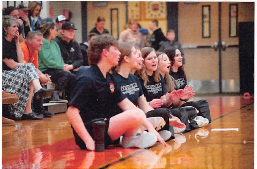
The cheer team rallies the wrestlers.